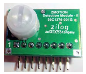
ZMOTION Detection Module II with Straight Connector (ZEPIROBBS02MODG)